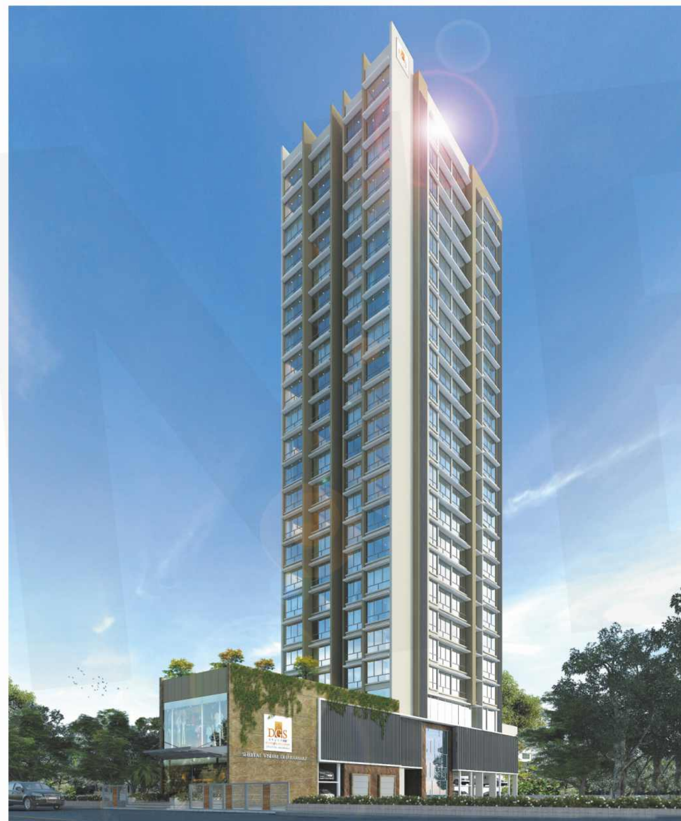
SHEETAL DHARMARAJ MALAD (WEST)