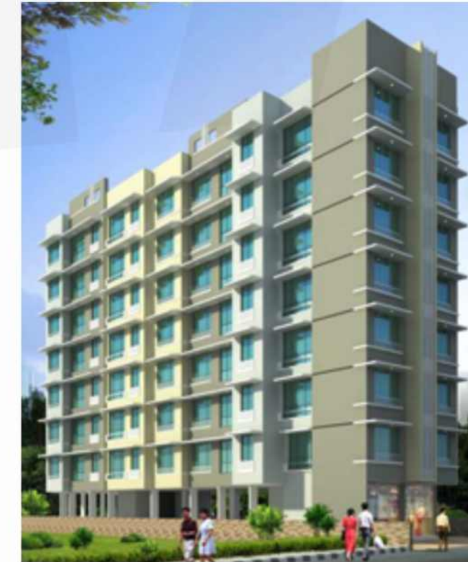
SHEETAL TULSI VIHAR MALAD (EAST)