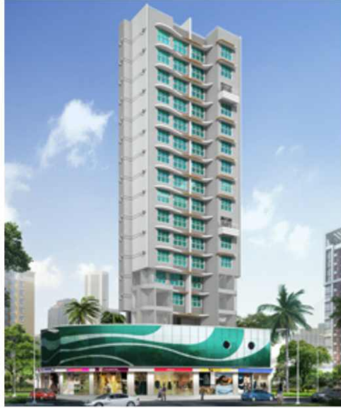
SHEETAL VASUDEV VASANT GOREGAON (EAST)