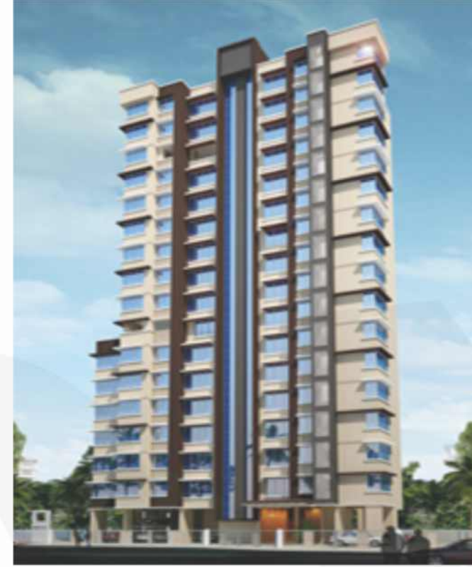
SHEETAL ANIKET GOREGAON (EAST)