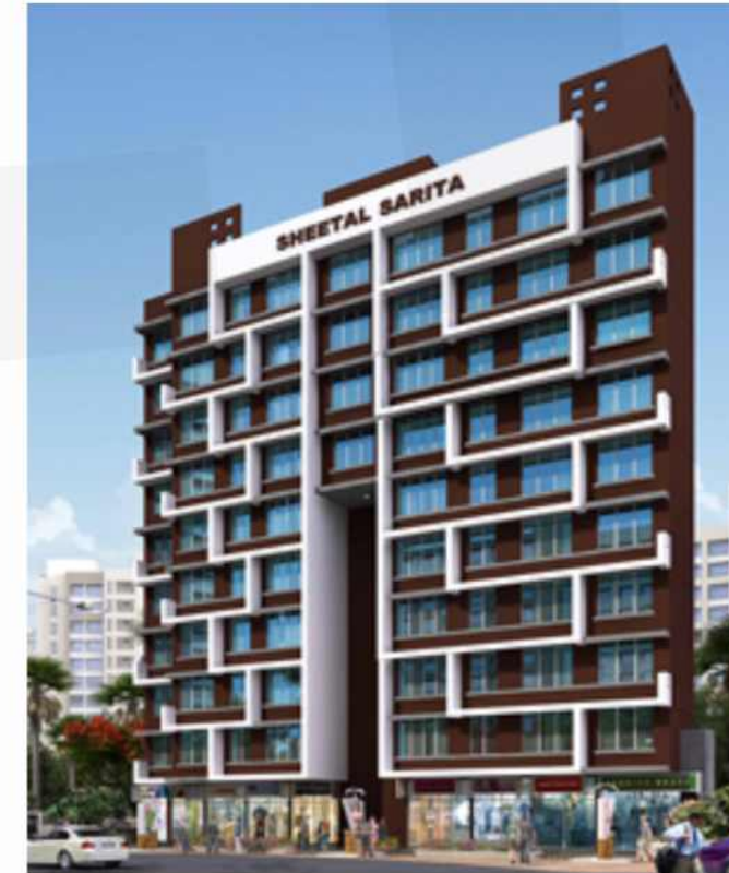
SHEETAL SARITA MALAD (EAST)