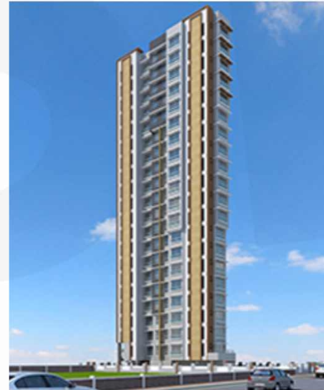
SHEETAL OM JAY ARADHANA MALAD (WEST)