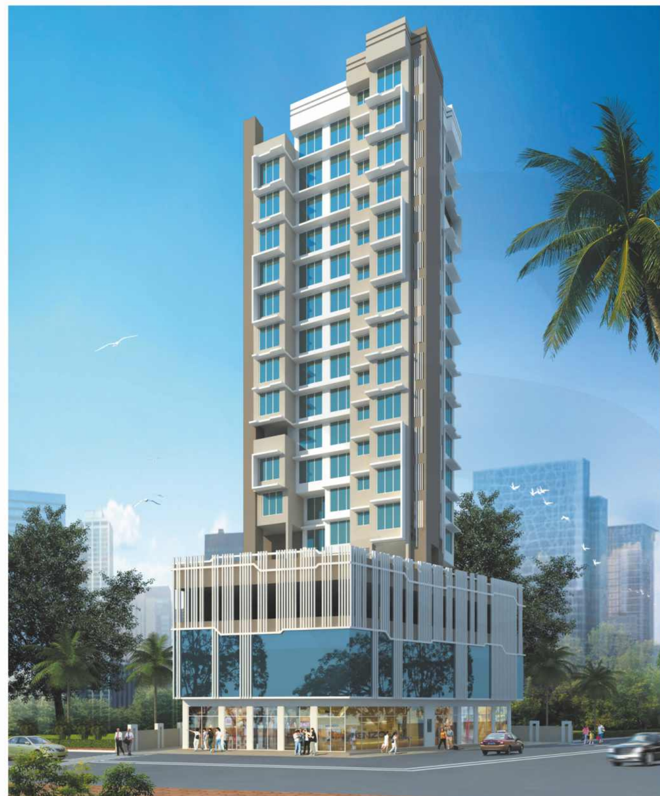
SHEETAL VILLA GOREGAON (EAST)