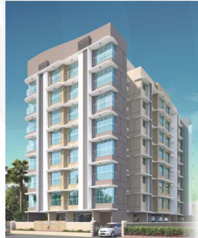
SHEETAL STANDARD BATTERIES MALAD (EAST)