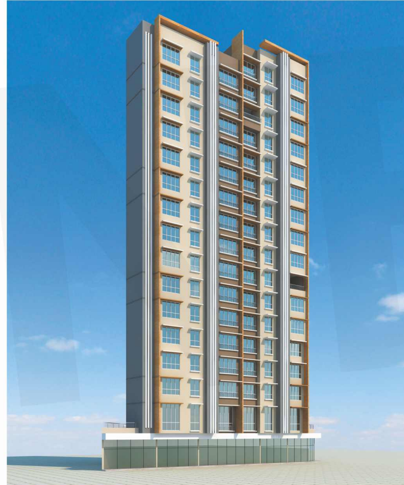
SHEETAL VAIBHAV KUTIR MALAD (EAST)