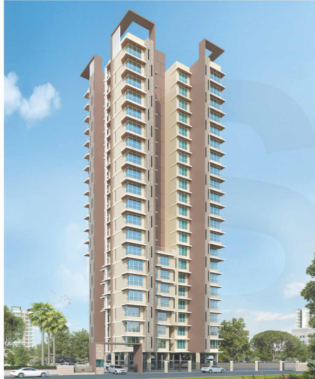
SHEETAL SATI SMURTI MALAD (EAST)