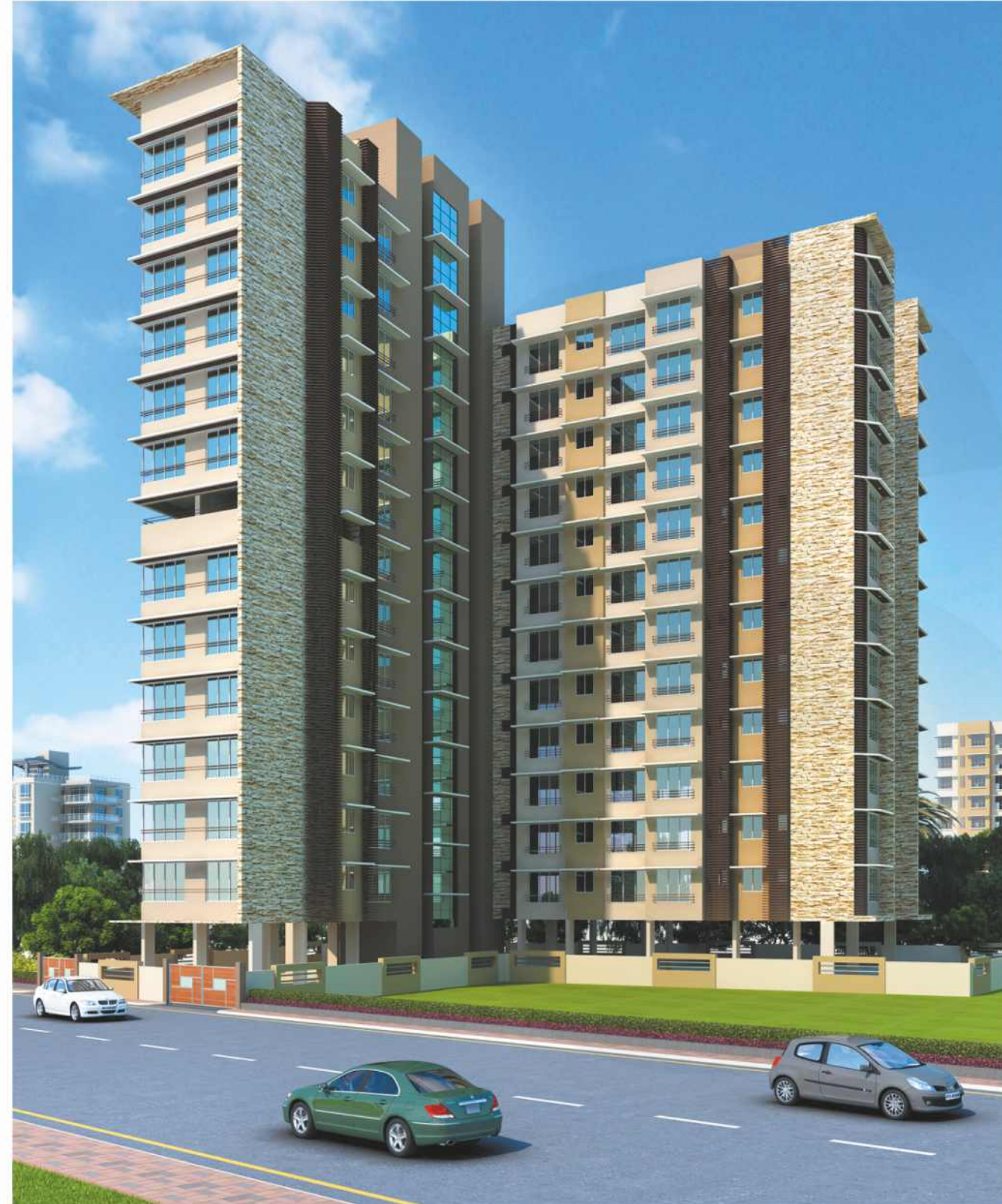
SHEETAL AIRWING SANTACRUZ (EAST)