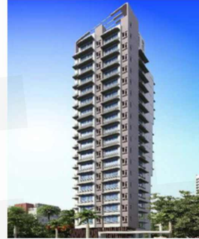
SHEETAL SHAKUNTALA GOREGAON (EAST)