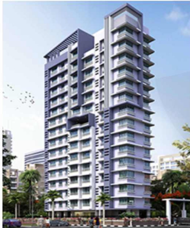
SHEETAL SWEET SEVEN MALAD (WEST)