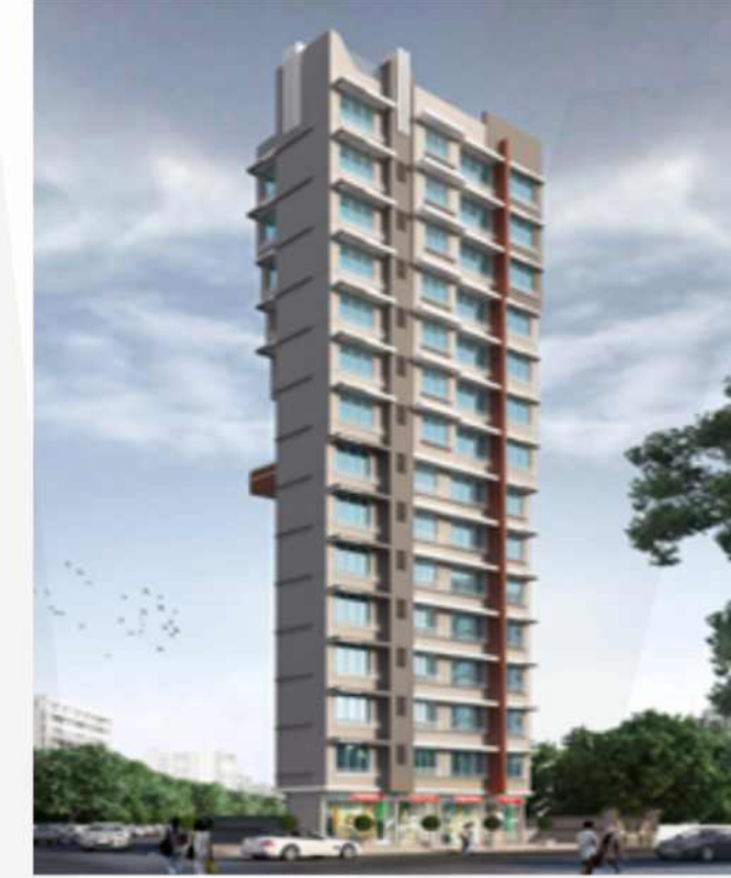
SHEETAL DWAR MALAD (EAST)