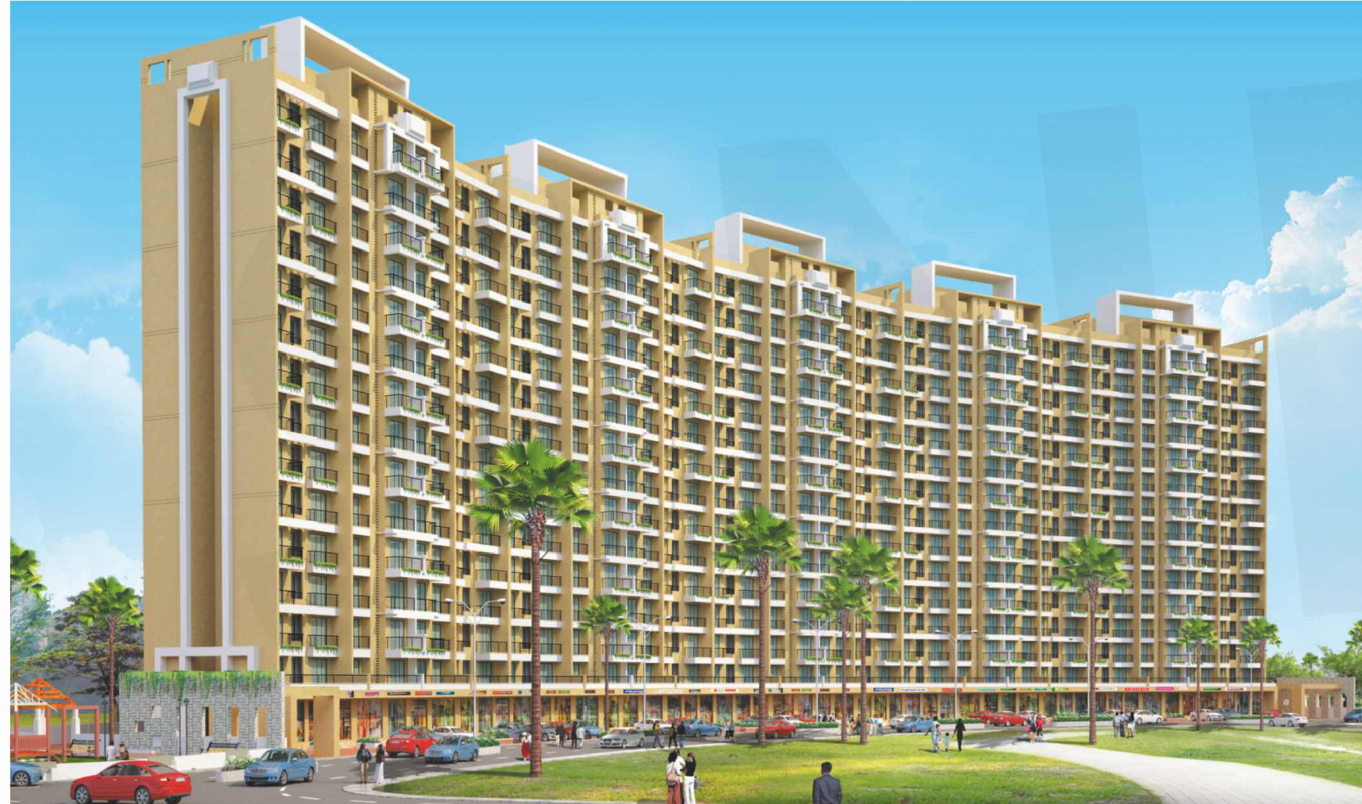
SHEETAL DEEP NALLASOPARA (WEST)