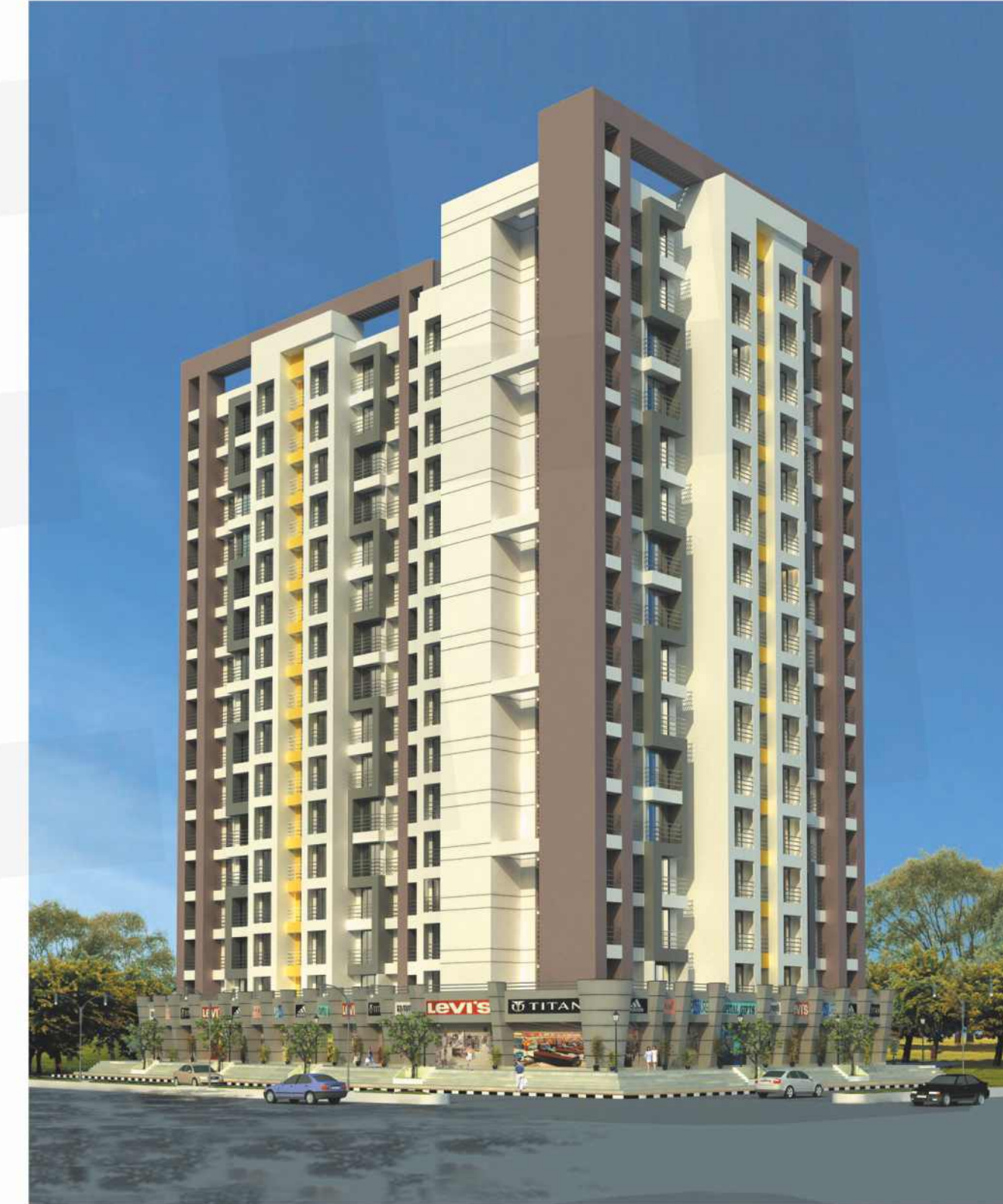
SHEETAL SEJAL NALLASOPARA (WEST)