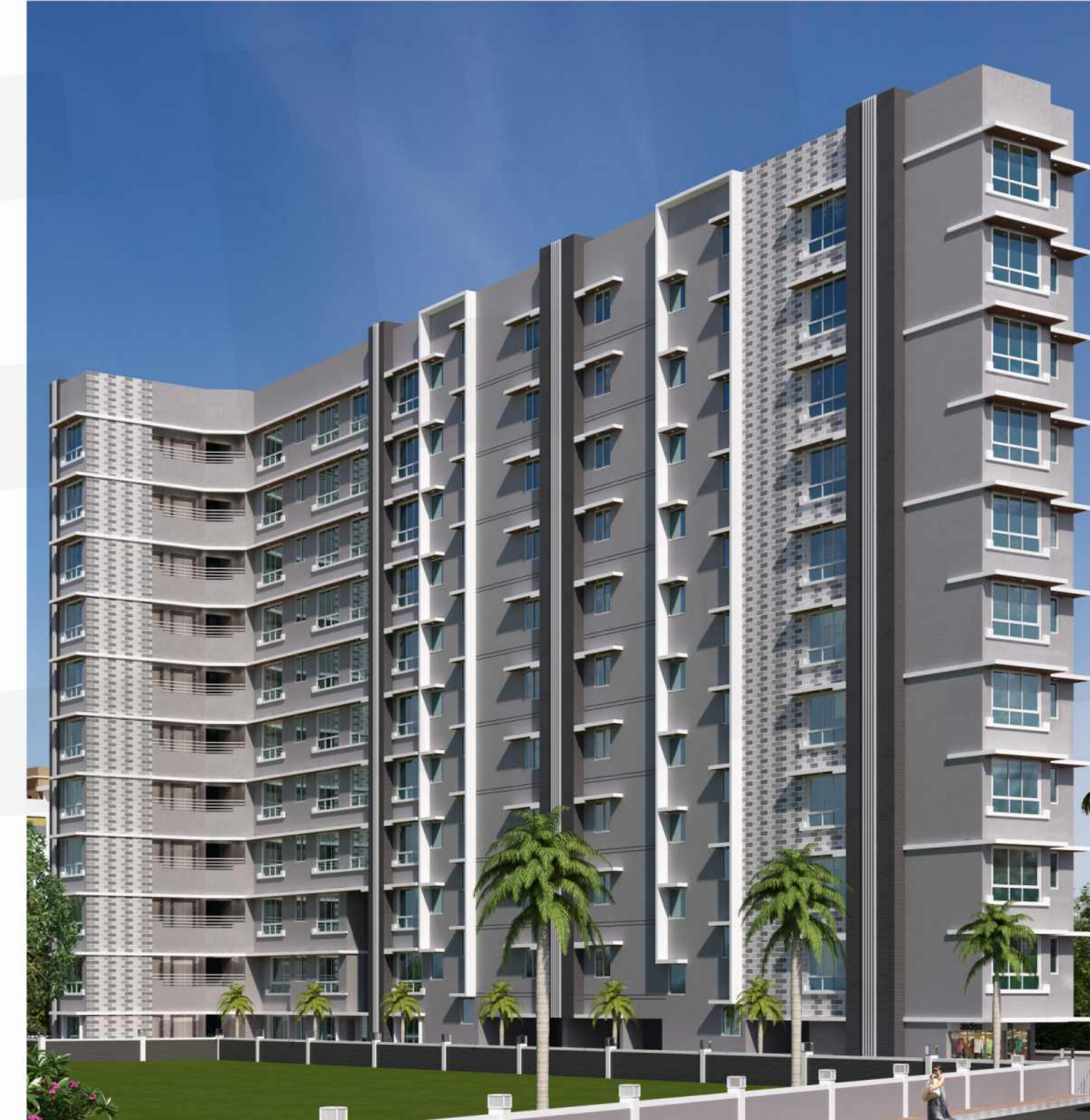
SHEETAL GANGA GOBIND SANTACRUZ (EAST)