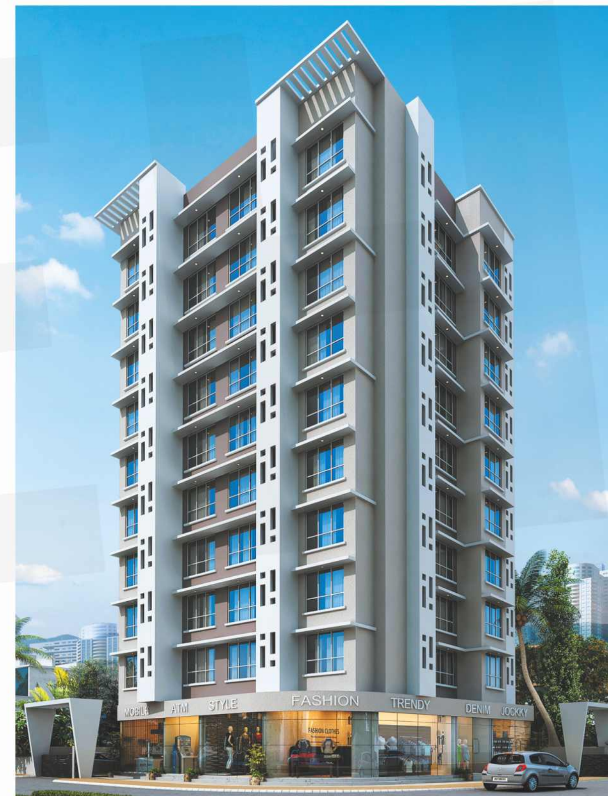
SHEETAL TRIMURTI MALAD (EAST)