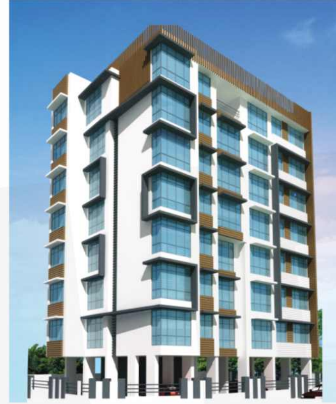
SHEETAL VIEW PARIJAT GOREGAON (EAST)